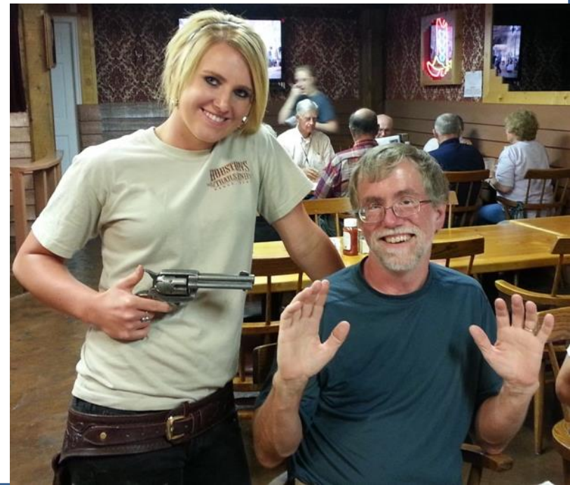
Day 1 (Page to Kanab) – Dinner in Kanab where the waitresses are armed!