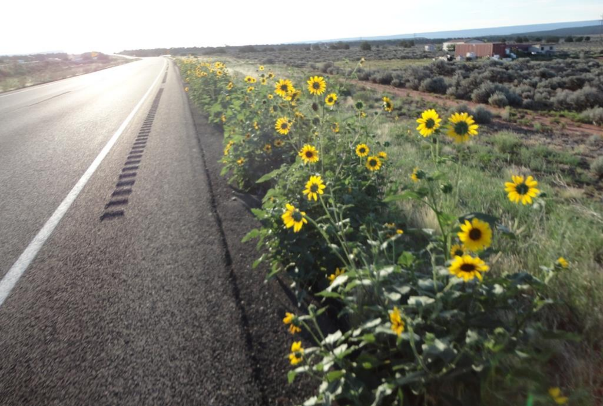
Day 1 (Page to Kanab) – Wild sunflowers were common along the road. We were grateful for the nice shoulders on the roads.