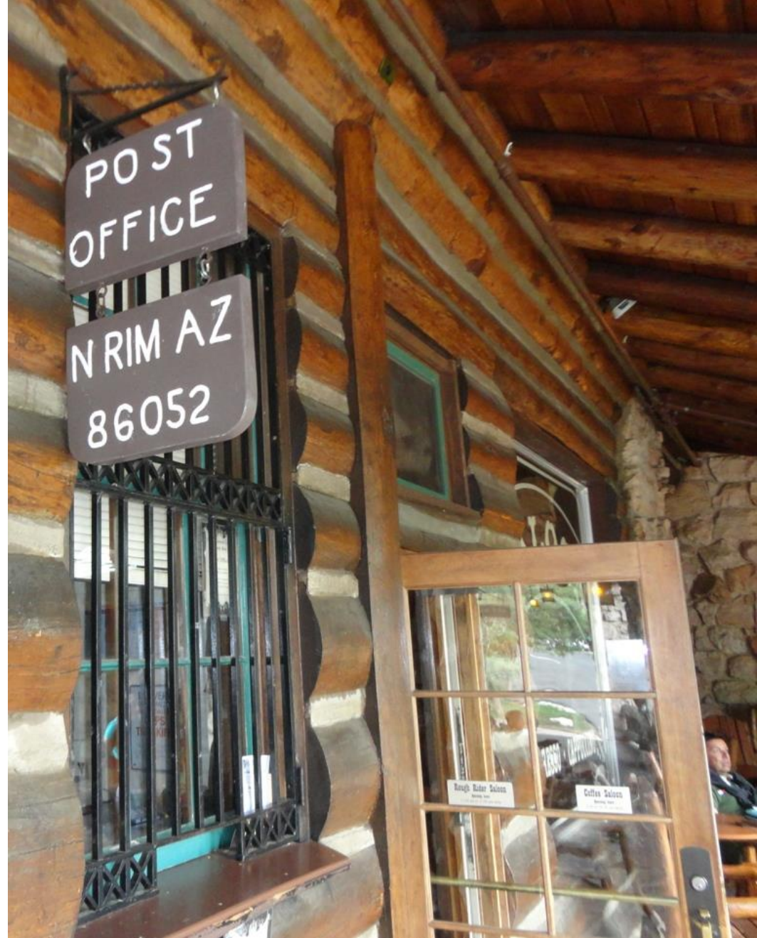
Day 7 (Jacob Lake to Grand Canyon) – Daryl and Sandy’s tires and air mattresses finally caught up with us – 7 days after they should have arrived in Page!