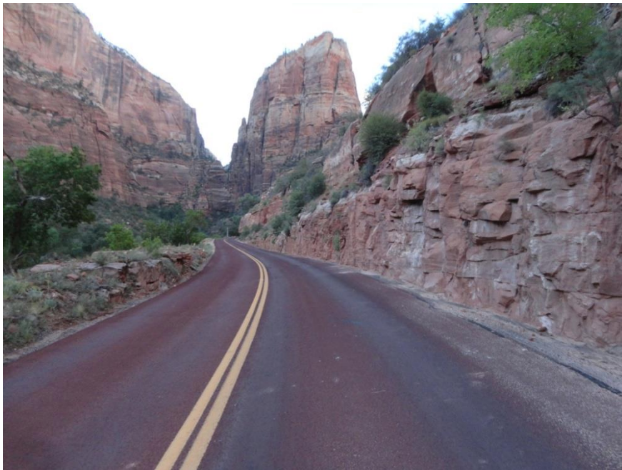
Zion National Park