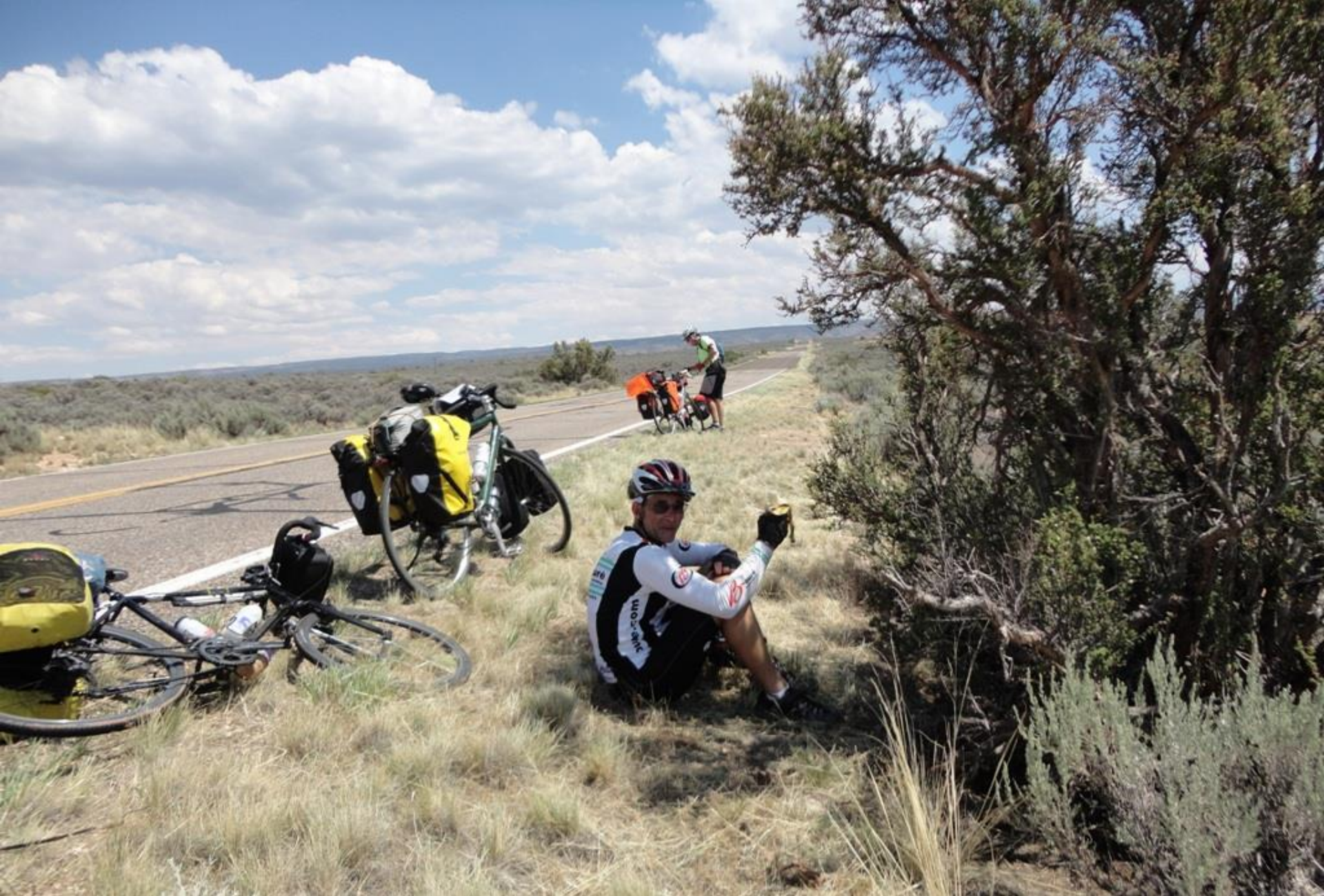
Day 6 (Zion to Jacob Lake) – We crossed a hot, barren stretch between Fredonia and Jacob Lake. Here we found a bush for some relief from the 100+ degree temps.