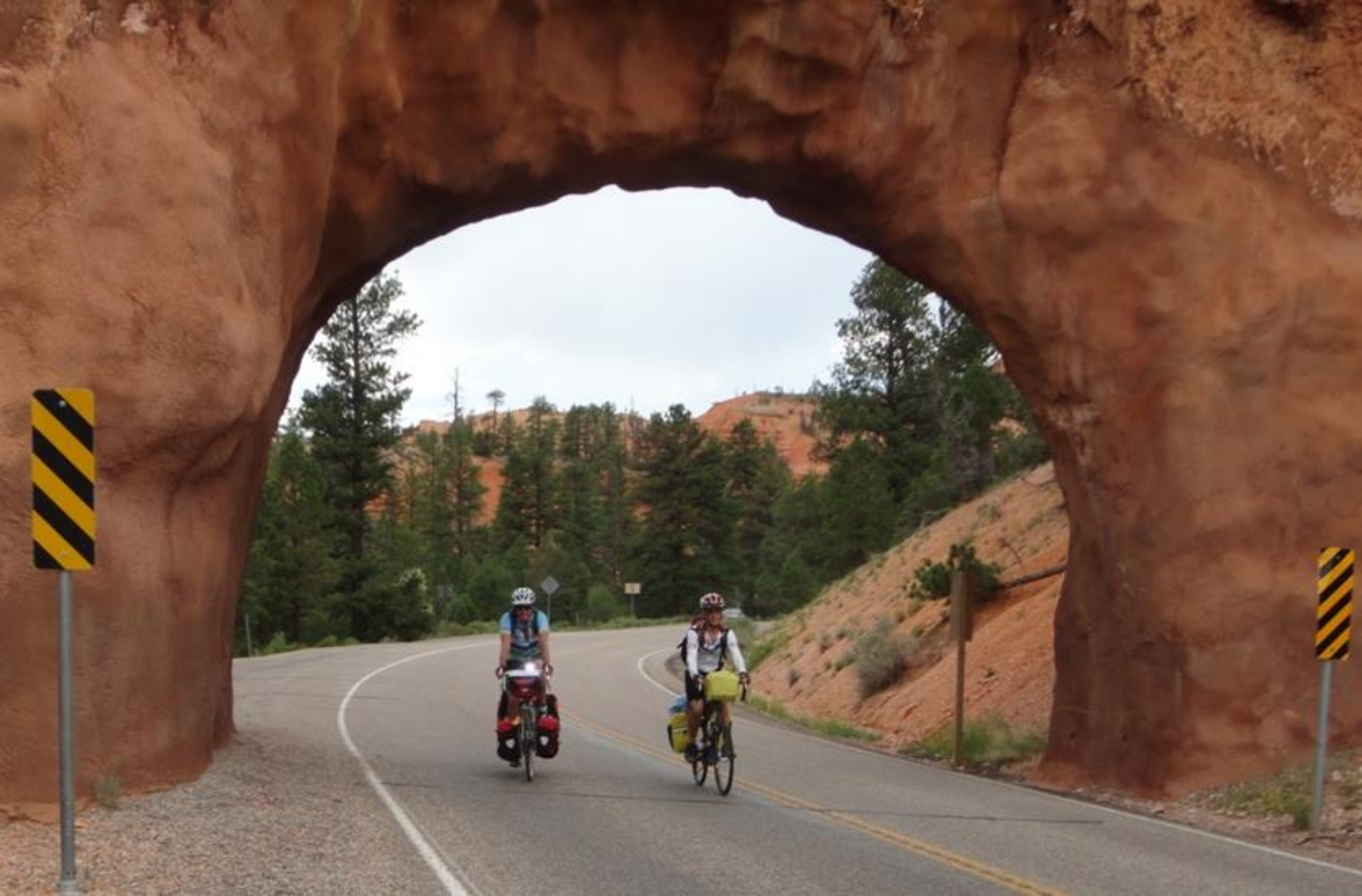
Day 2 (Kanab to Bryce Canyon) – Dennis and Dean cycle through a tunnel in Red Canyon on the way to Bryce Canyon.