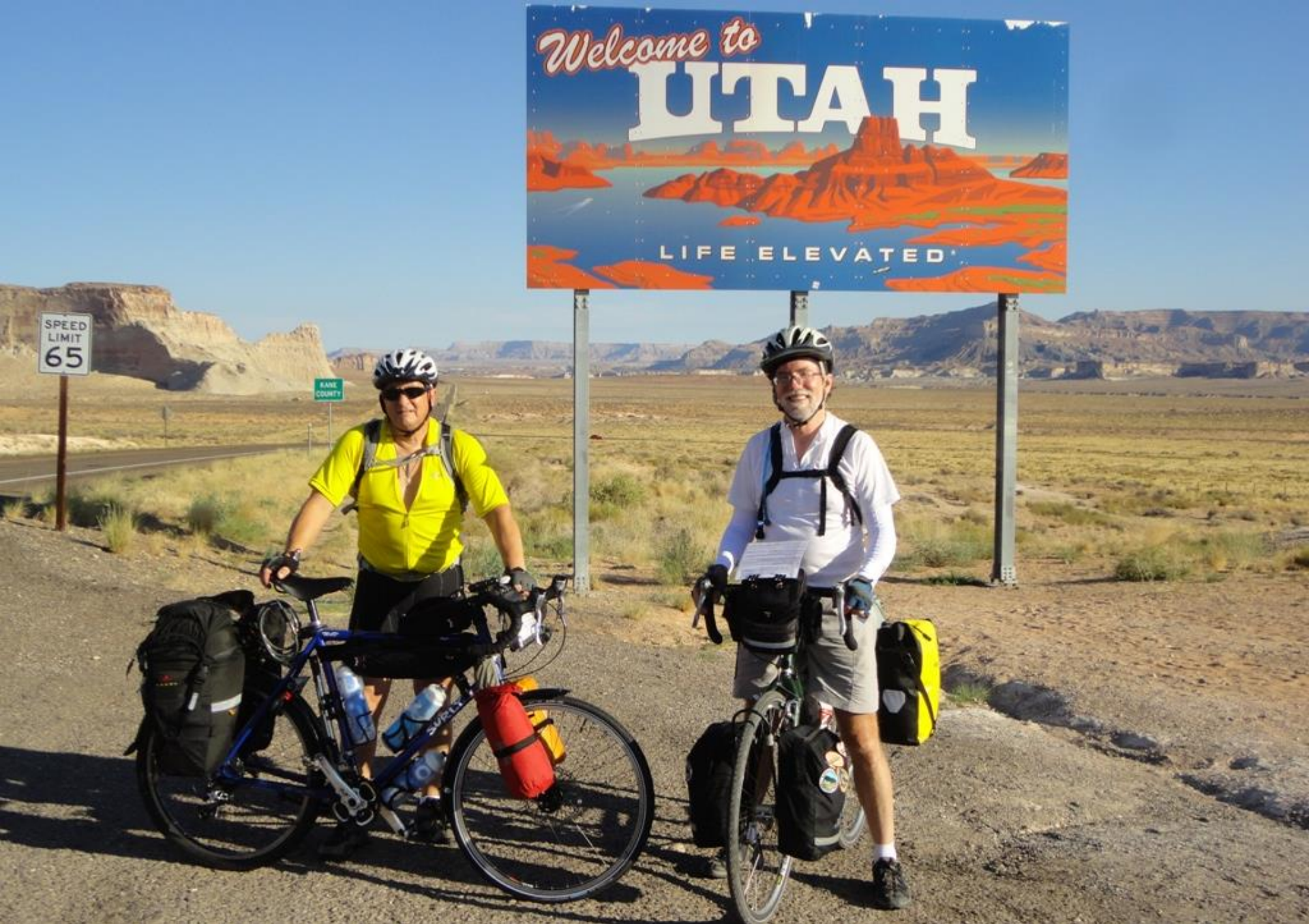
Day 1 (Page to Kanab) – It was a long hot ride to Kanab, but the scenery was amazing!