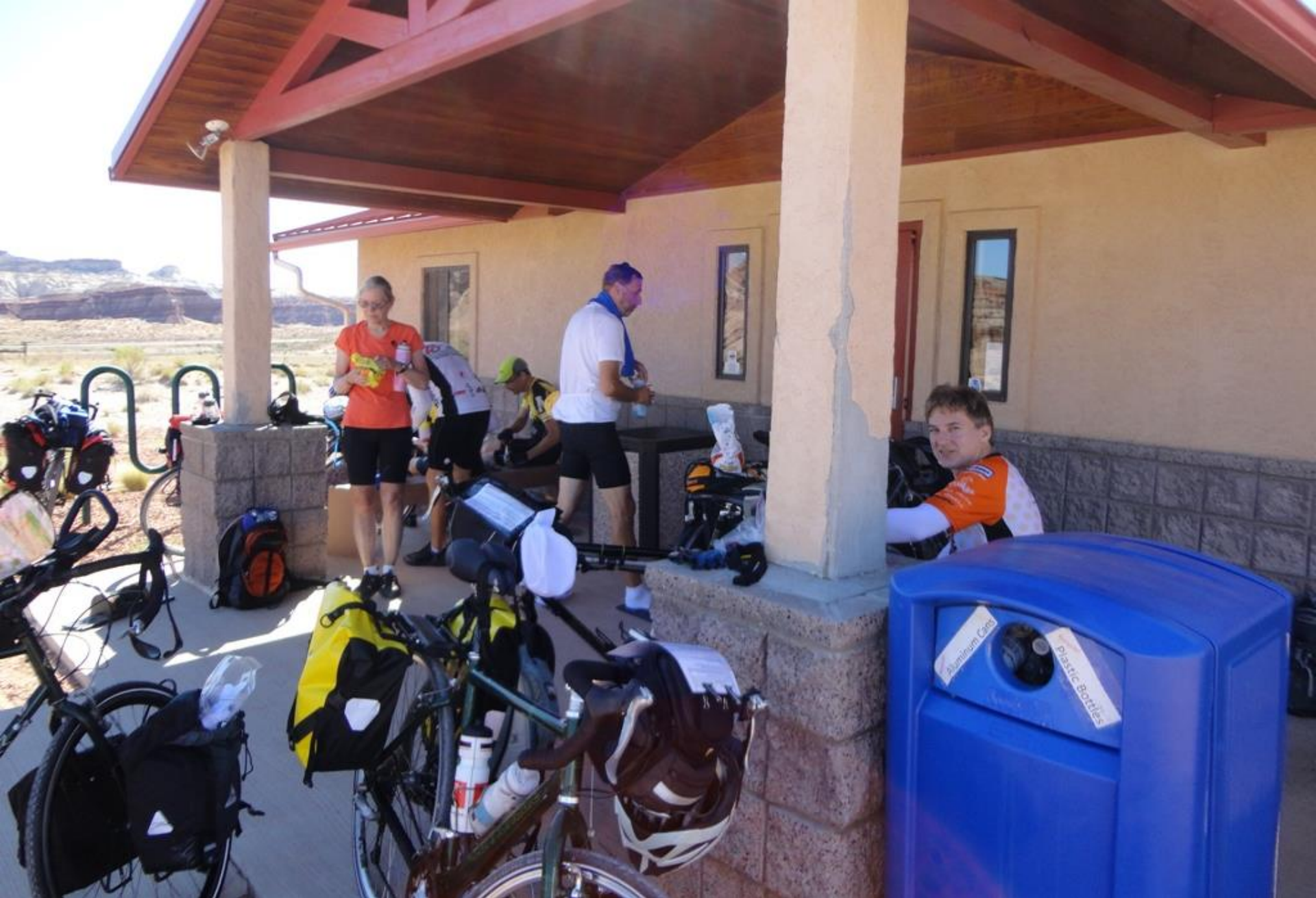
Day 1 (Page to Kanab) – We stopped for lunch at this BLM Office – it was the only place to get water for at least 50 miles as we crossed the desert-like area between Page and Kanab.