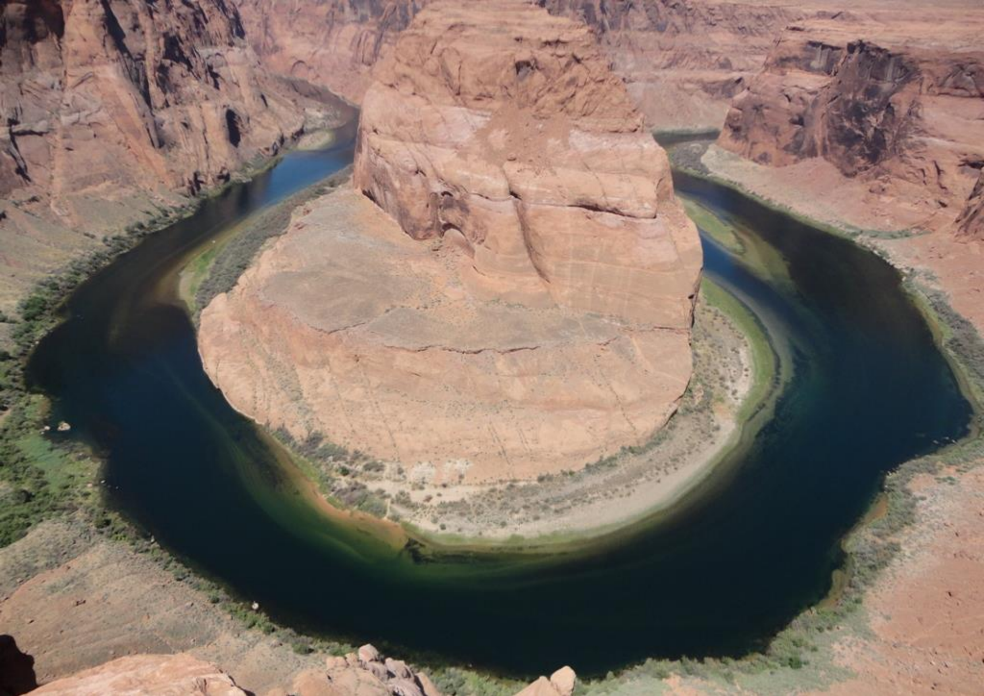
Day 0 (Page) – Horseshoe Bend