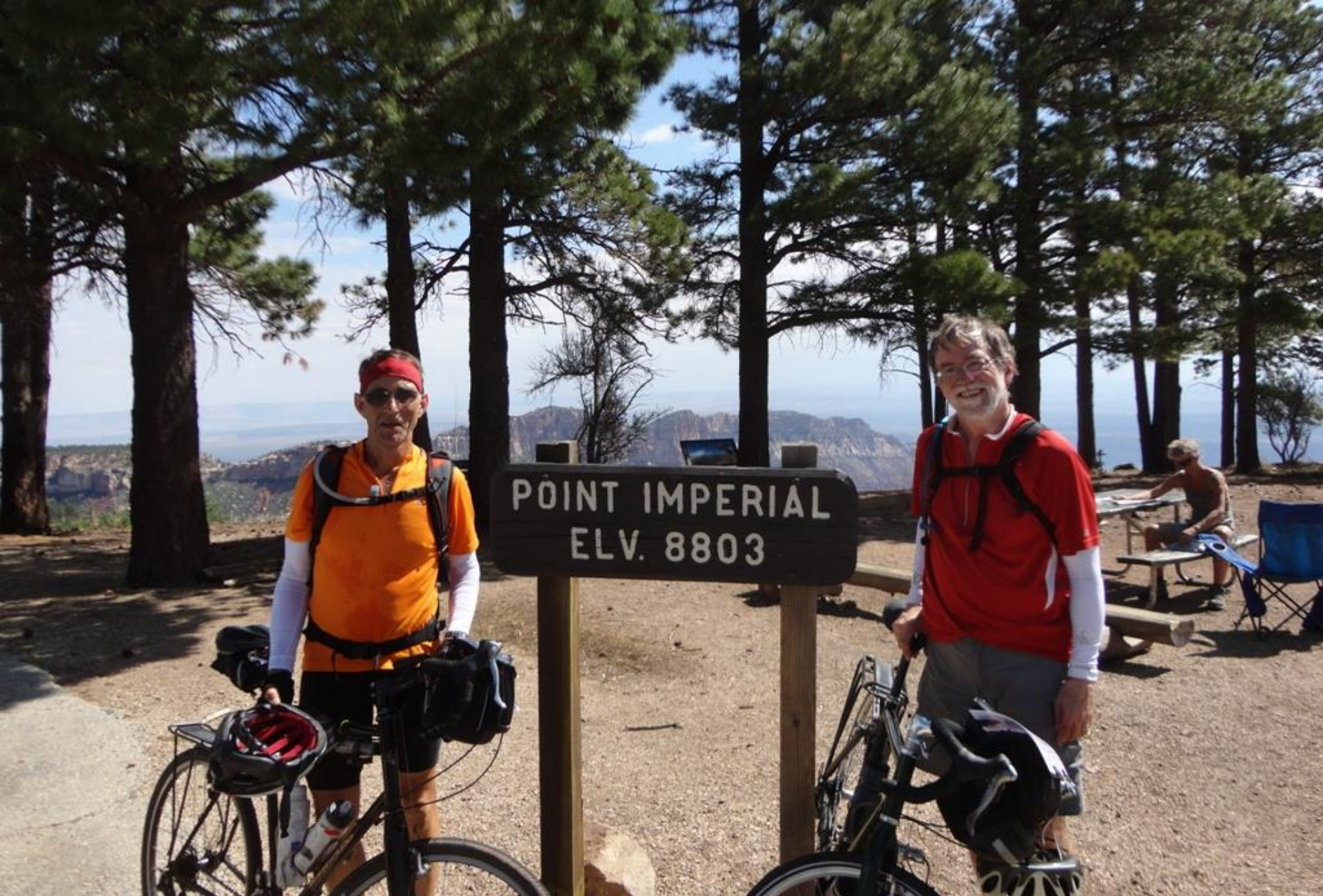
Day 8 (Grand Canyon) – We spent two nights at the northern rim. We spent Day 8 cycling, hiking, and relaxing. Some of us cycled to Point Imperial, which was well worth the trip.