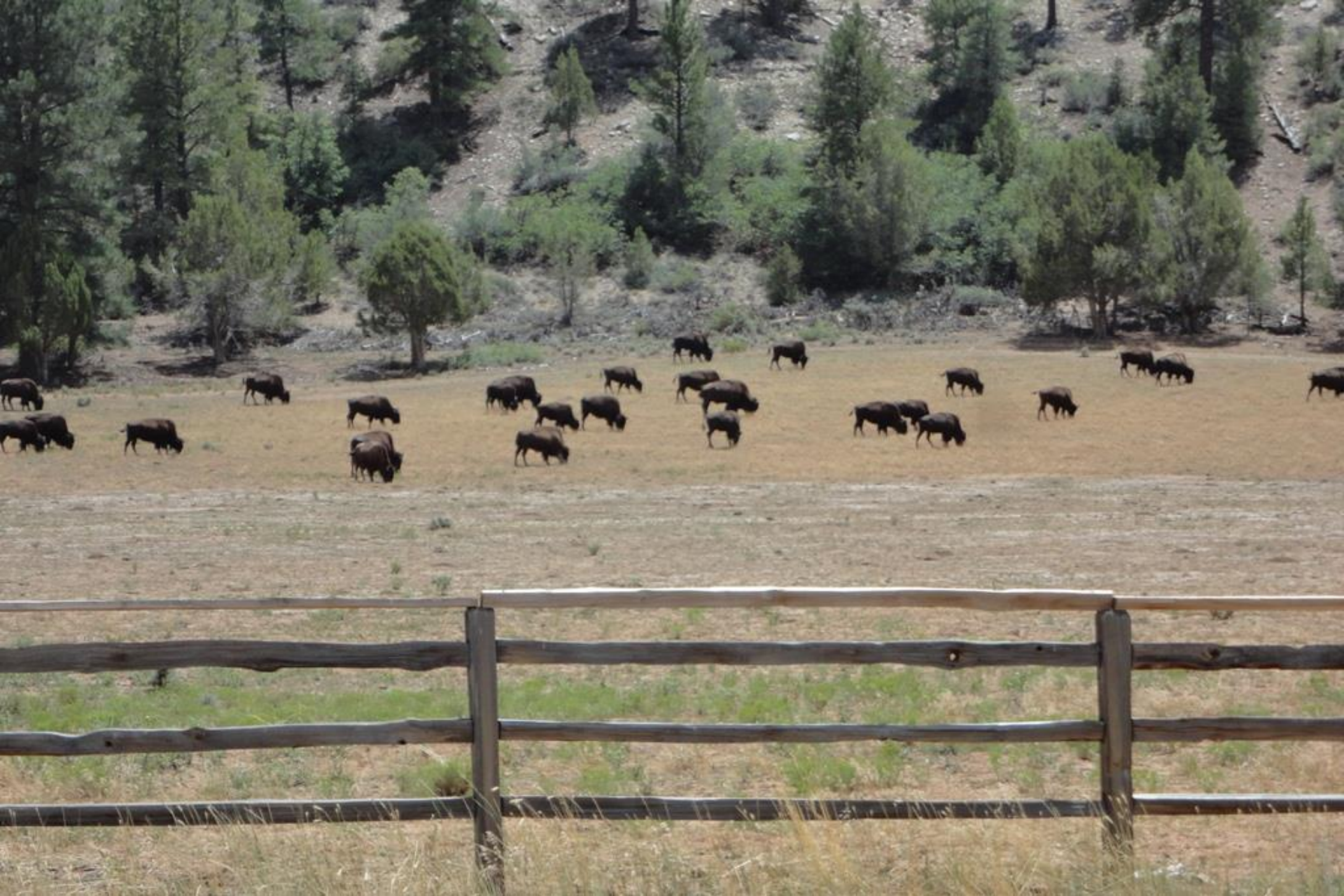
Day 5 (Cedar Breaks to Zion) – Bison along the road the Zion National Park