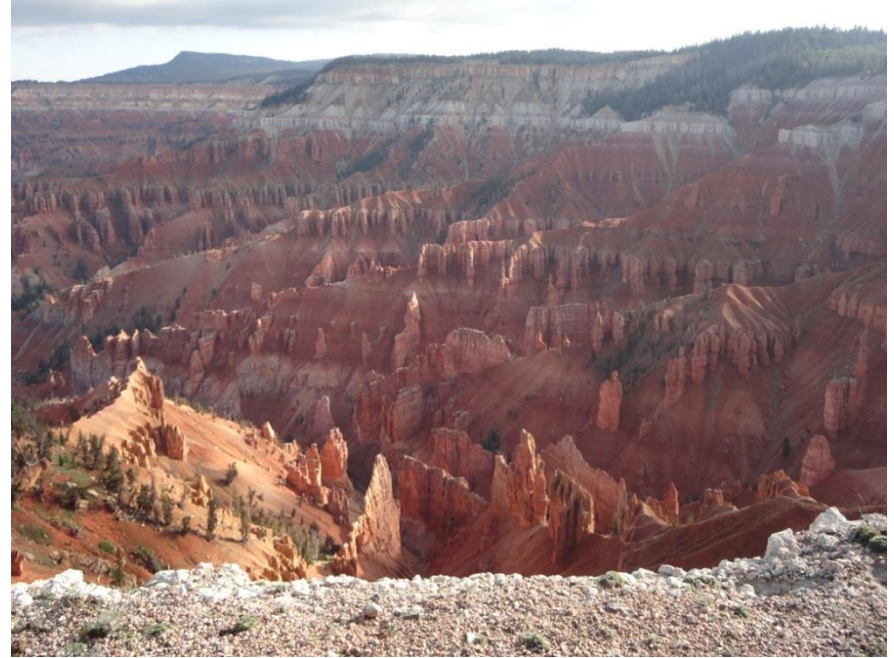
Cedar Breaks National Monument