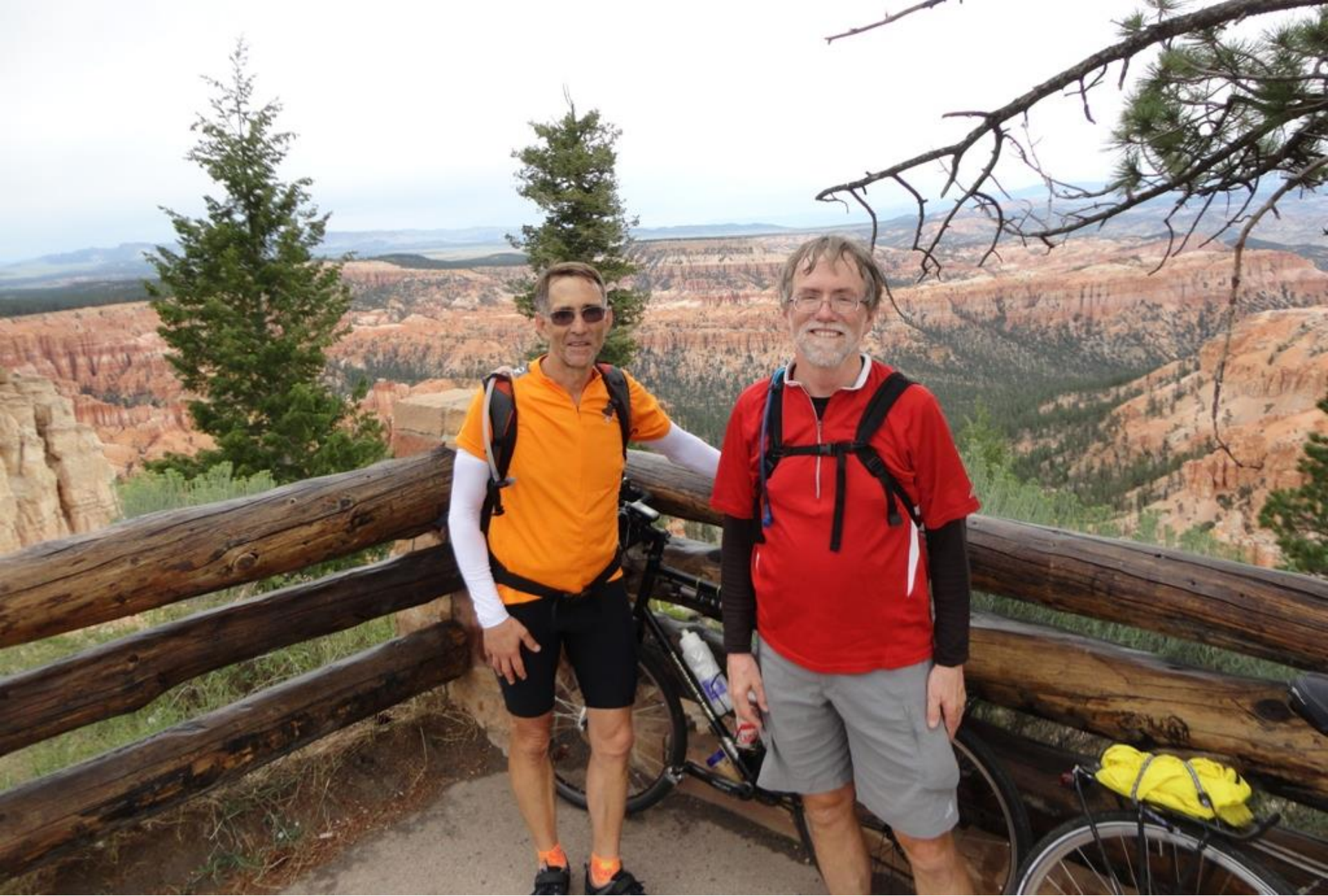
Day 3 (Bryce Canyon) – Bryce Canyon has many amphitheaters along the 20-mile road through the park.