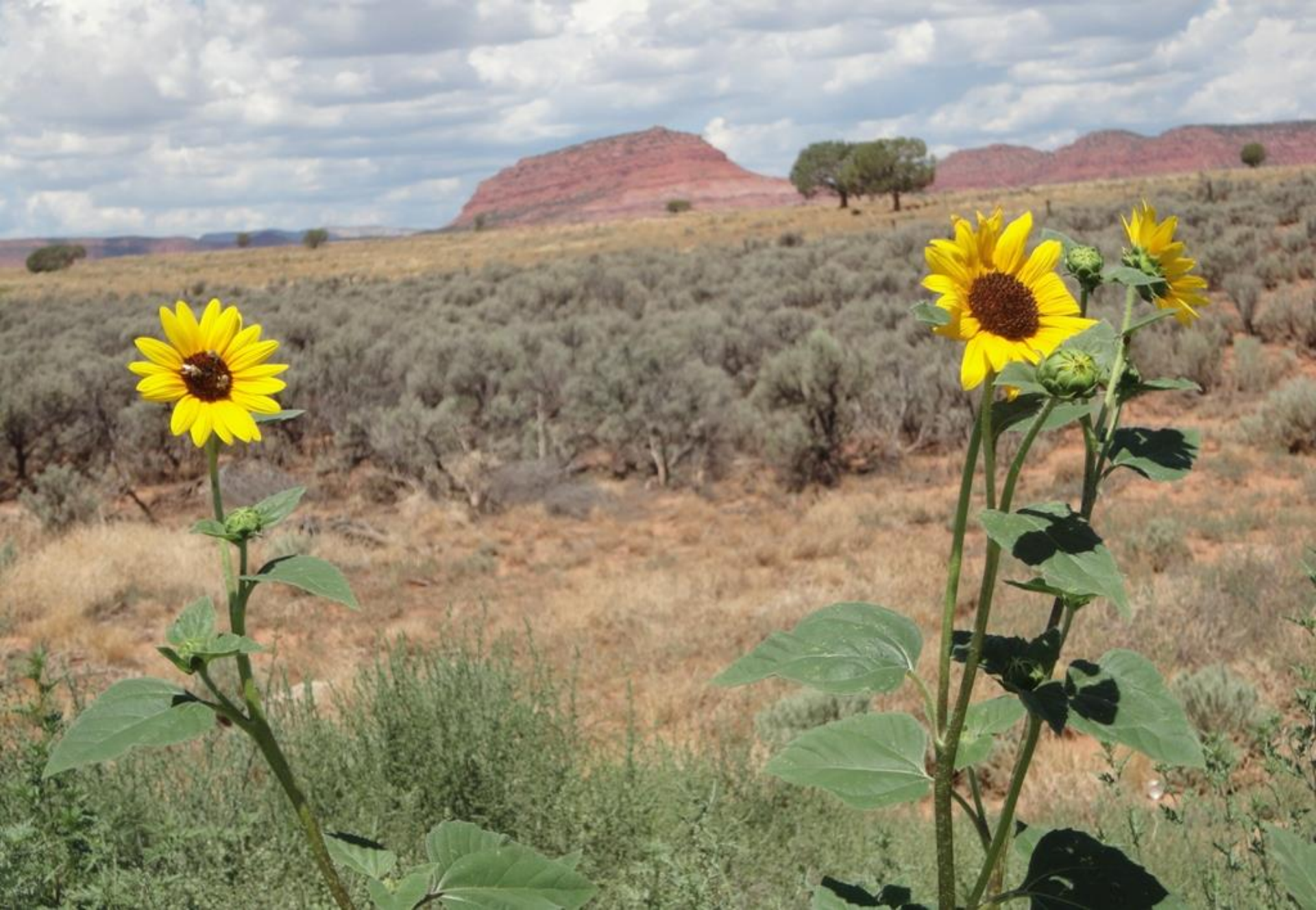
Day 1 (Page to Kanab) – Flowers were common in this hot, dry area.