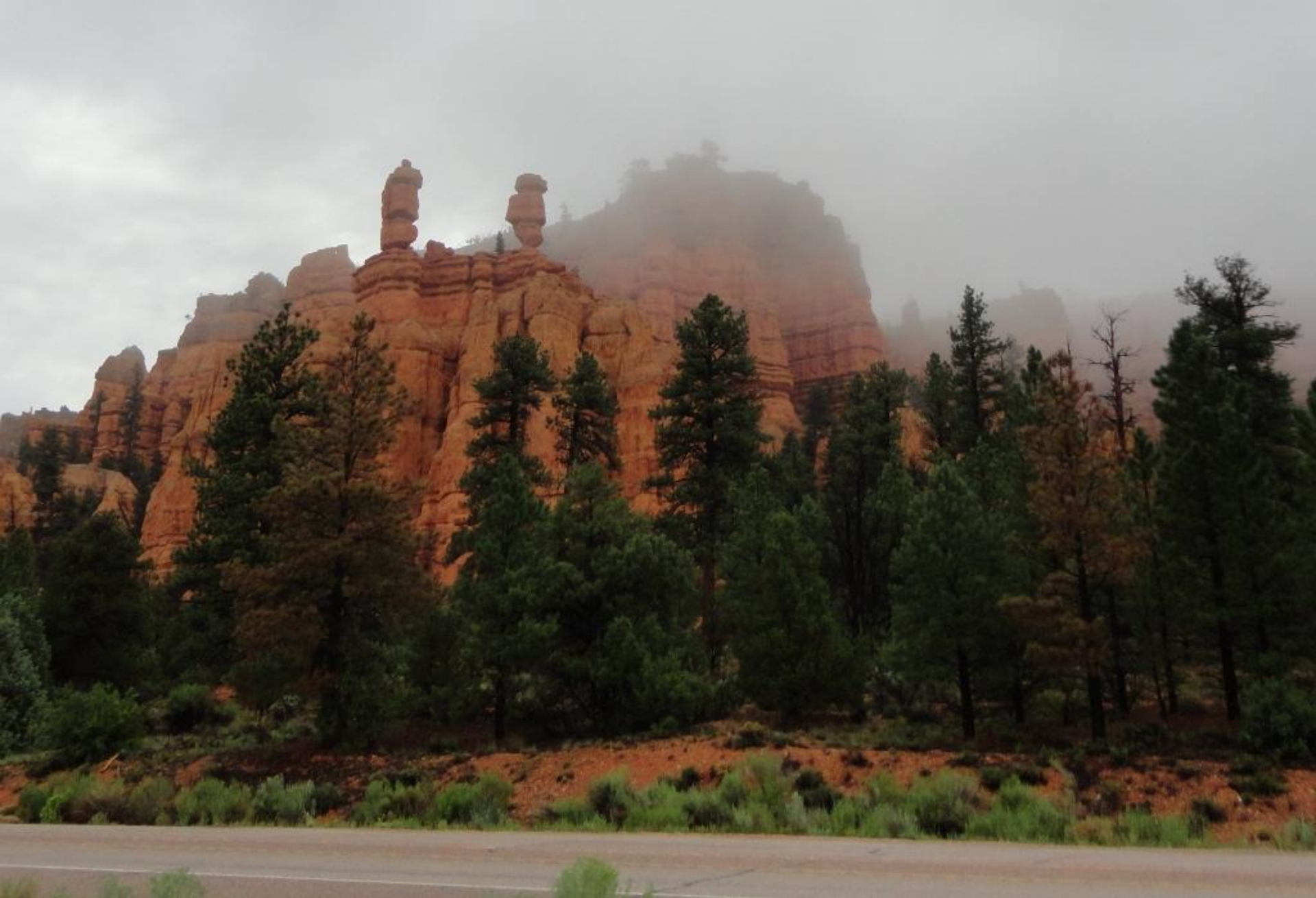
Day 4 (Bryce Canyon to Cedar Breaks) – We left Bryce Canyon and cycled along the Red Canyon Bike Trail. We were enchanted by the views in the morning fog.