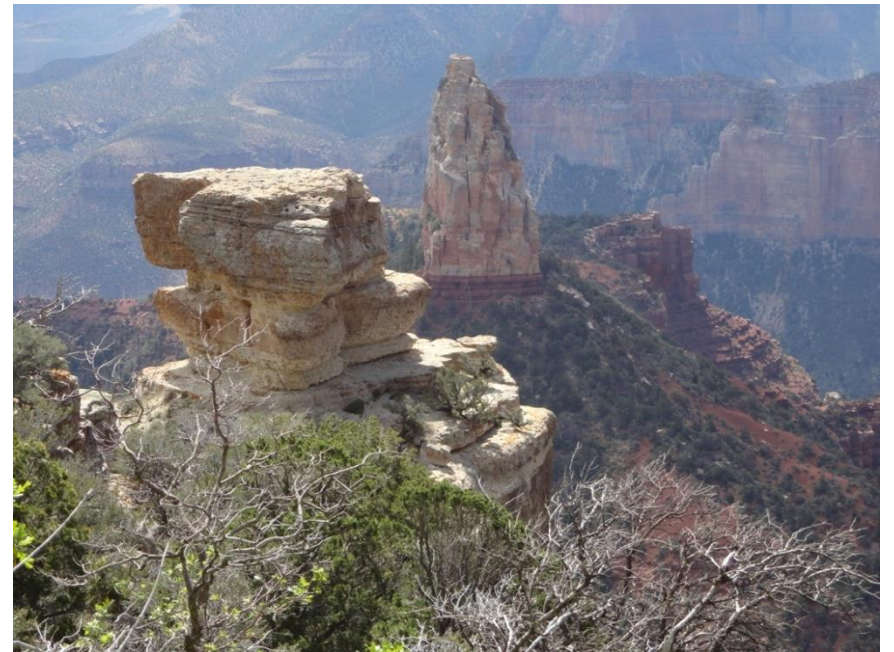
Grand Canyon – Northern Rim