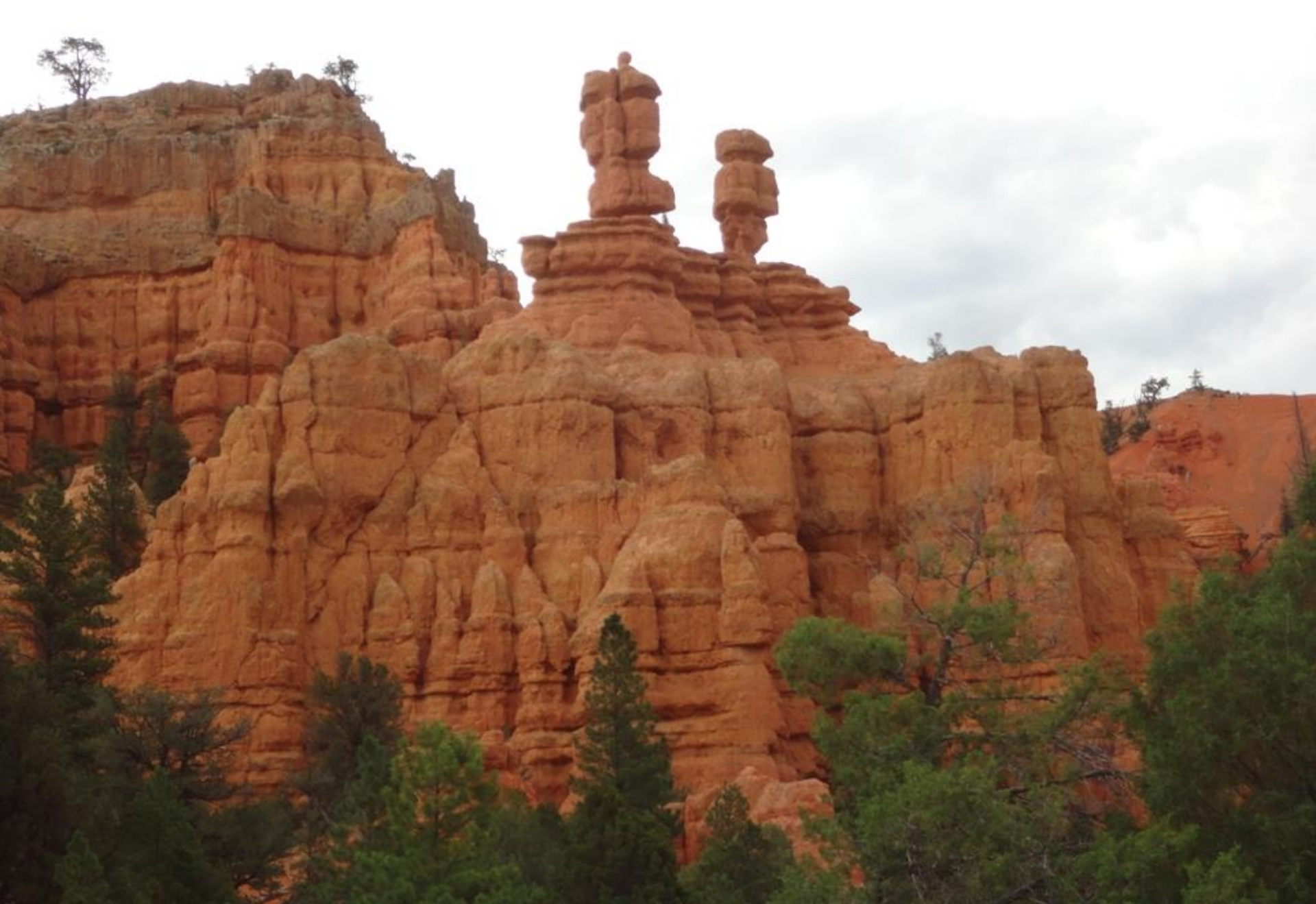
Day 2 (Kanab to Bryce Canyon) – Hoodoos in Red Canyon