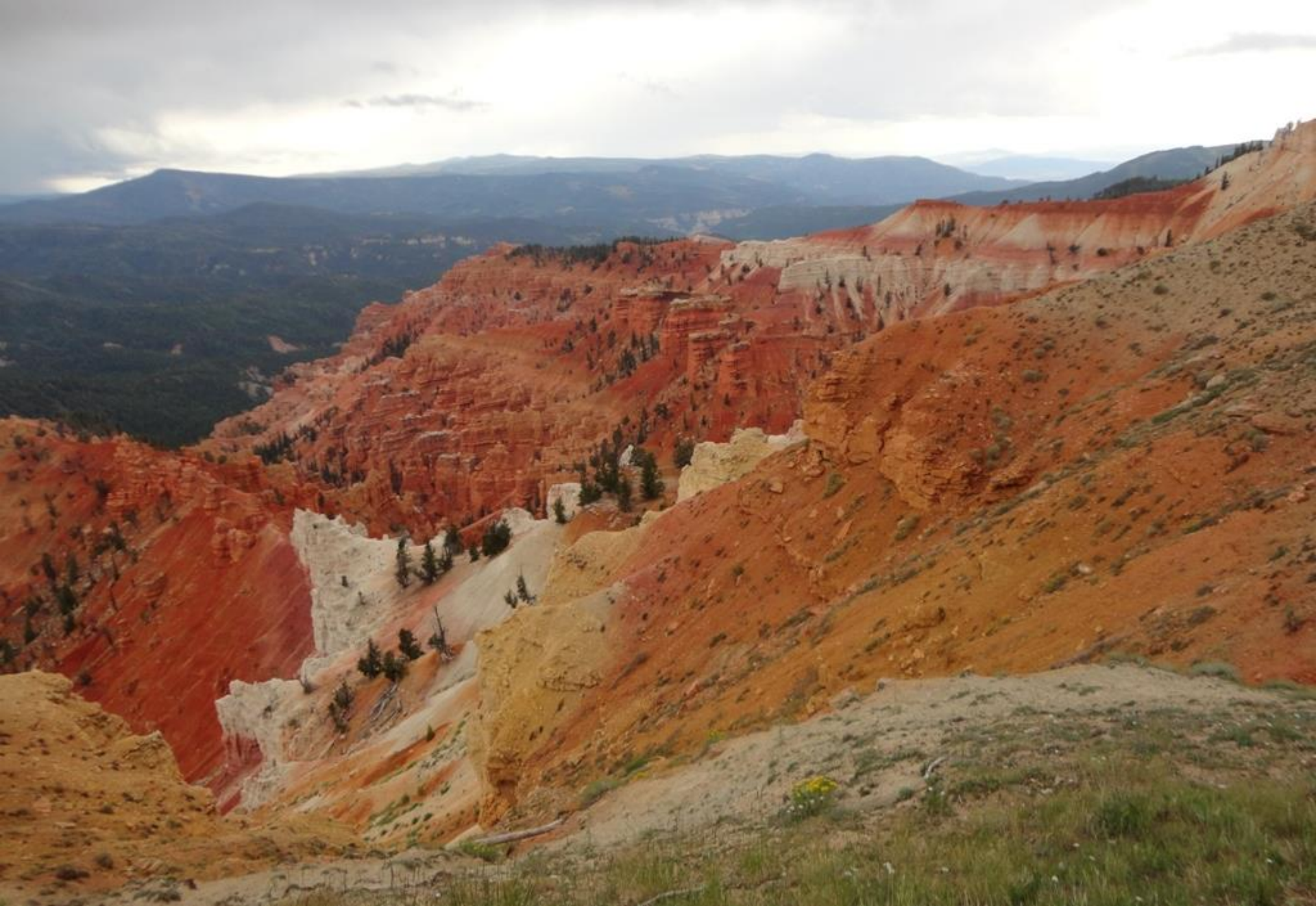
Day 4 (Bryce Canyon to Cedar Breaks) Cedar Breaks National Monument – a seemingly endless amphitheater