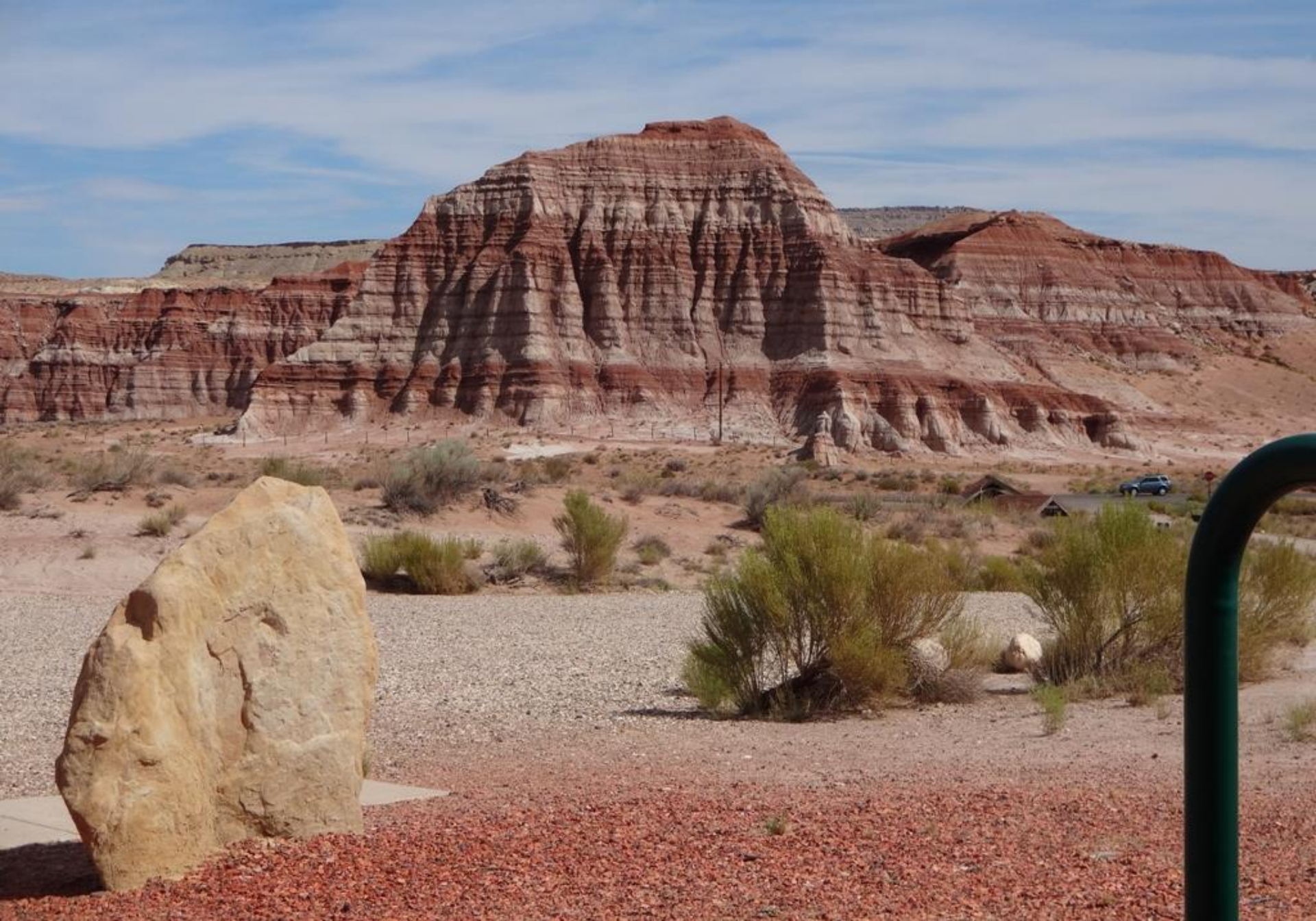
Day 1 (Page to Kanab) – Colorful rock formations were all around us