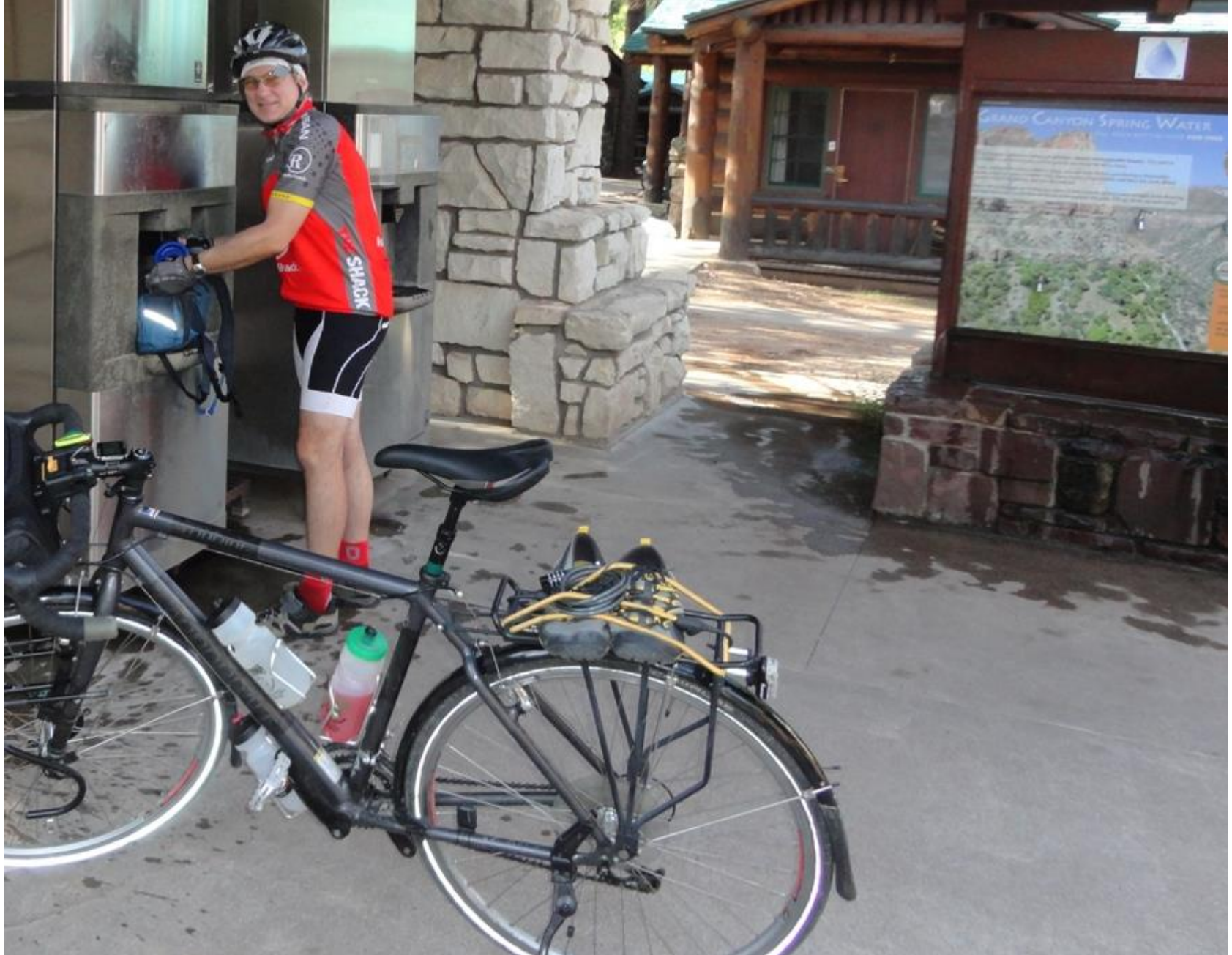
Day 8 (Grand Canyon) – The visitor center at the northern rim had outdoor ice machines and spring water for hikers (and cyclists)!