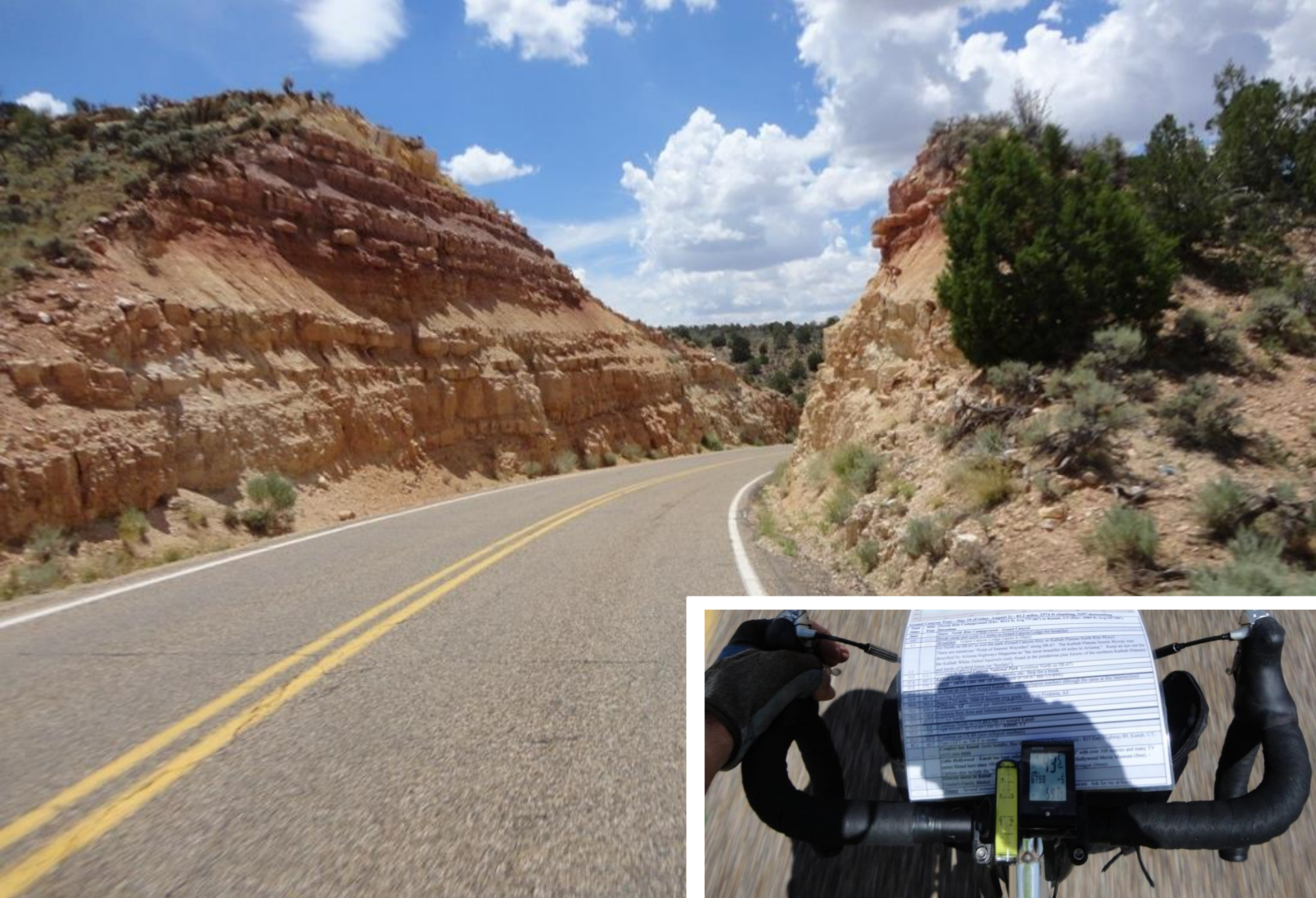
Day 9 (Grand Canyon to Kanab) – We had an amazing downhill section from Jacob Lake before the crossing the desert-like area on the way to Fredonia (computer reads 43.5 mph)