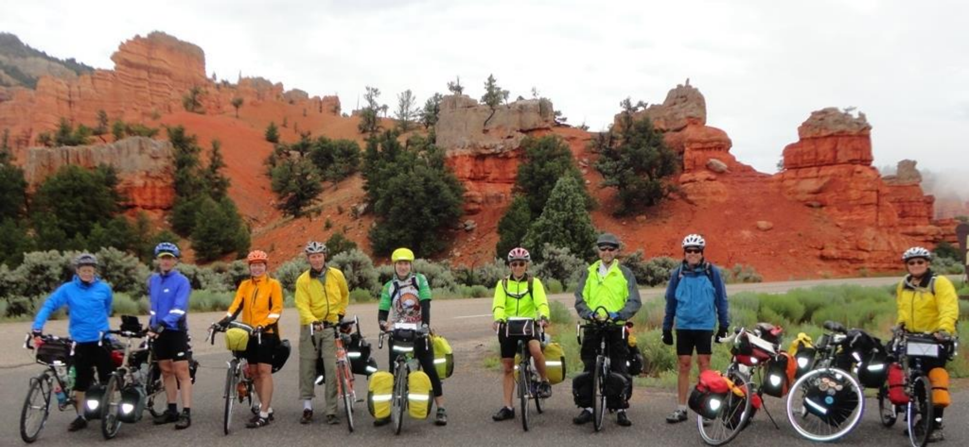
Day 4 (Bryce Canyon to Cedar Breaks) – Cycling through Red Canyon in the morning with temperatures in the 50s.