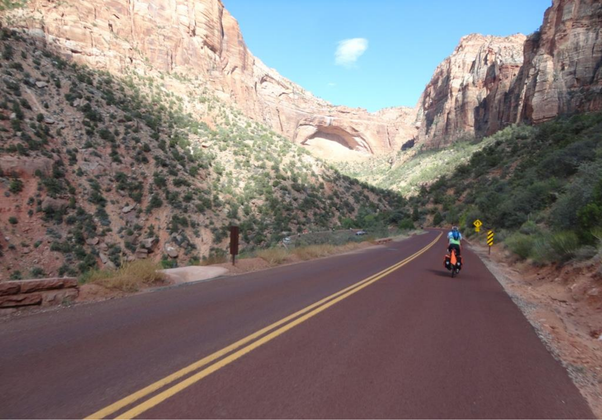
Day 5 (Cedar Breaks to Zion) – The descent into Zion