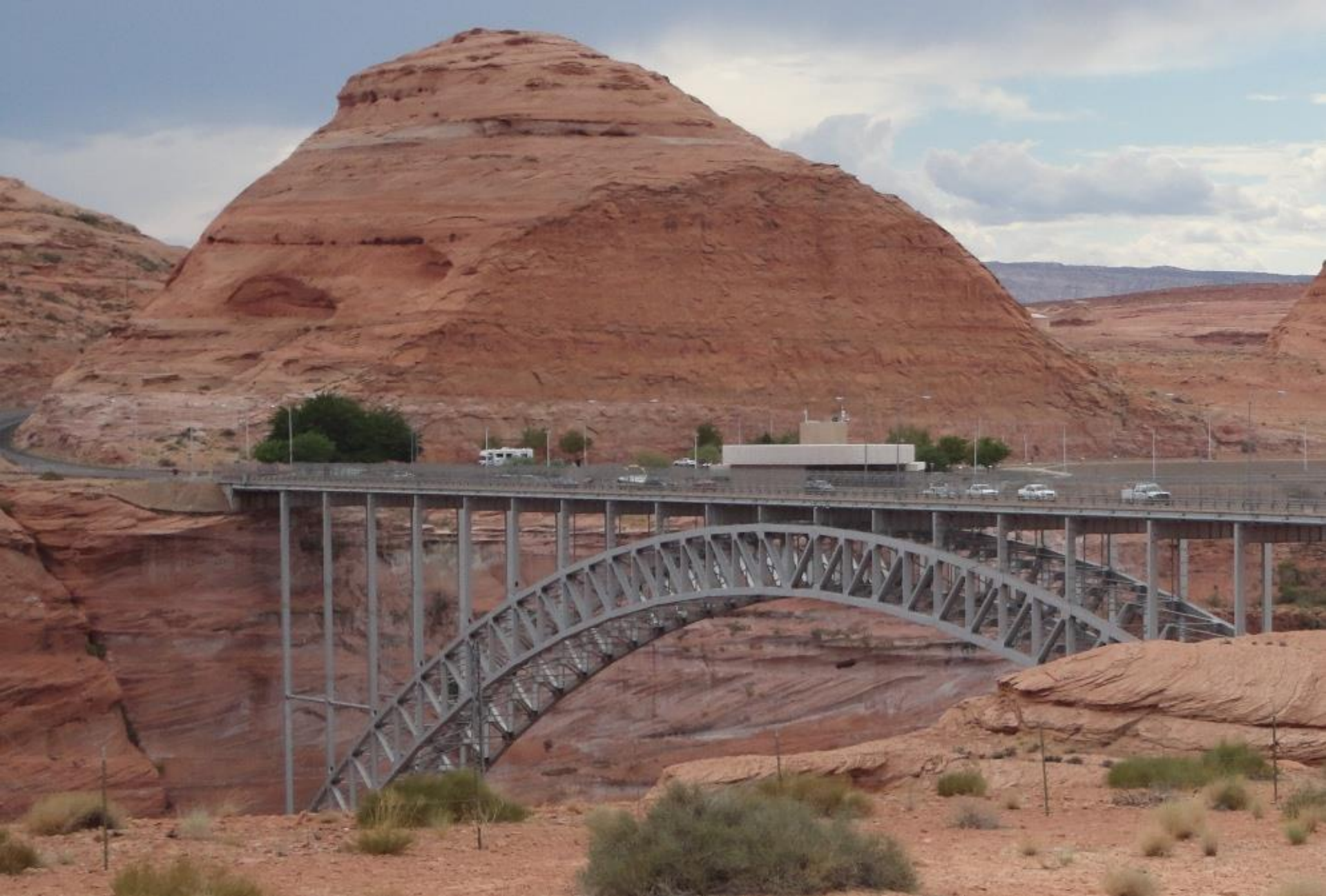
Day 0 (Page) – Bridge over the Colorado River next to the Glen Canyon Dam