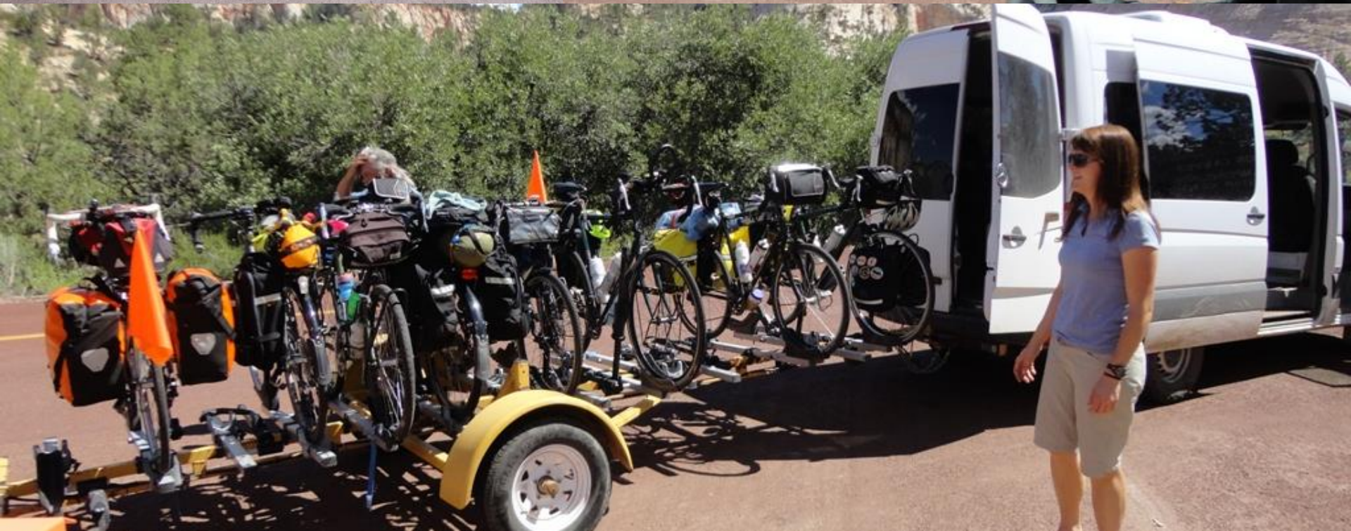
Day 5 (Cedar Breaks to Zion) – We had to be shuttled though the Zion Tunnel.