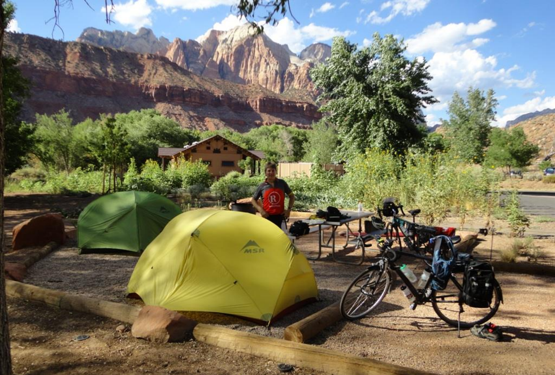
Day 5 (Cedar Breaks to Zion) – What a campsite in Zion National Park!