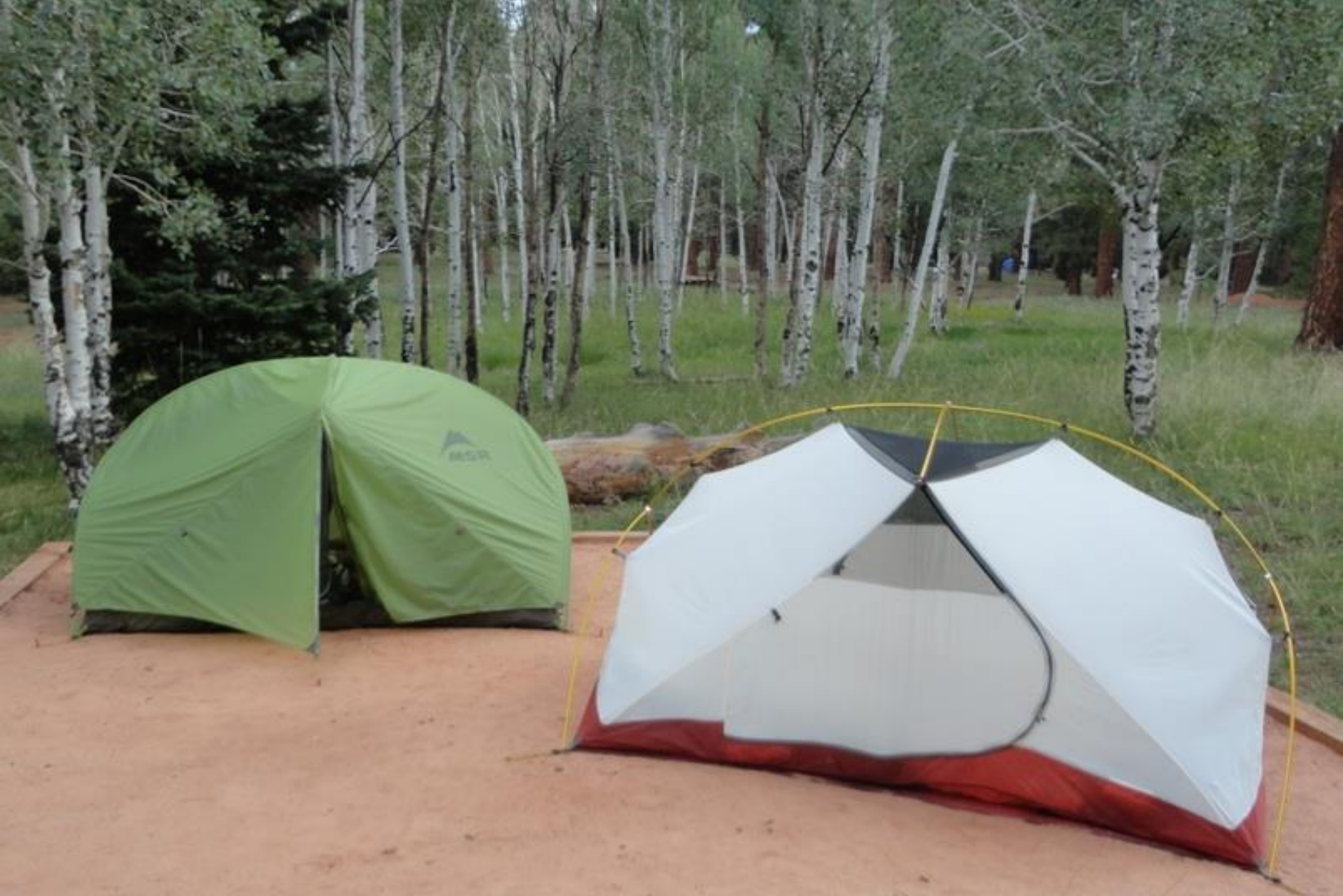
Day 7 (Jacob Lake to Grand Canyon) – Paul & Robert's campsite at the northern rim in a grove of young Aspen trees. We were about 100 ft from the rim!