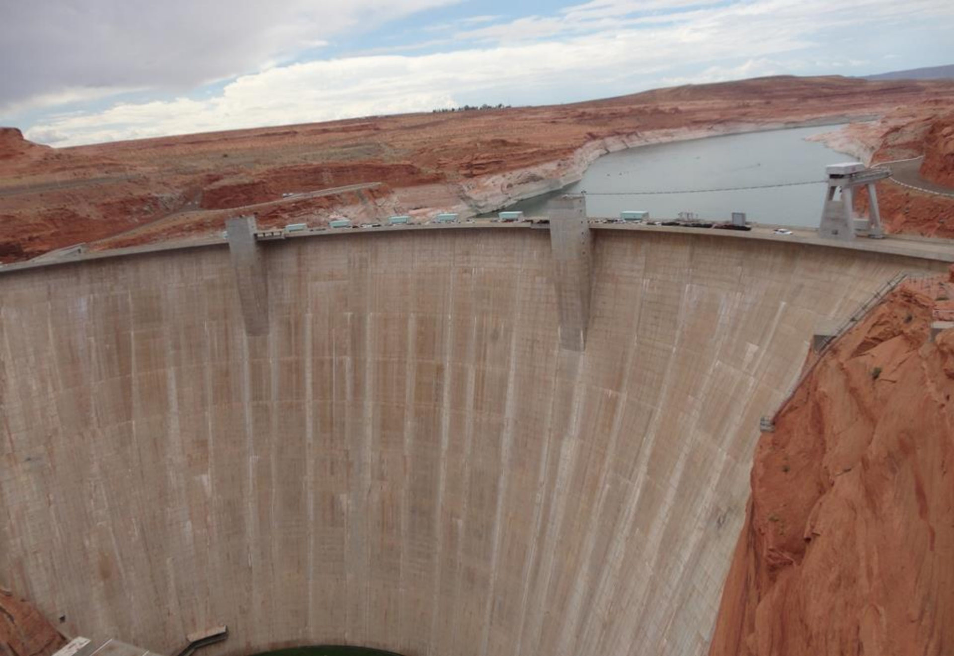
Day 0 (Page) – Glen Canyon Dam (see from the bridge)