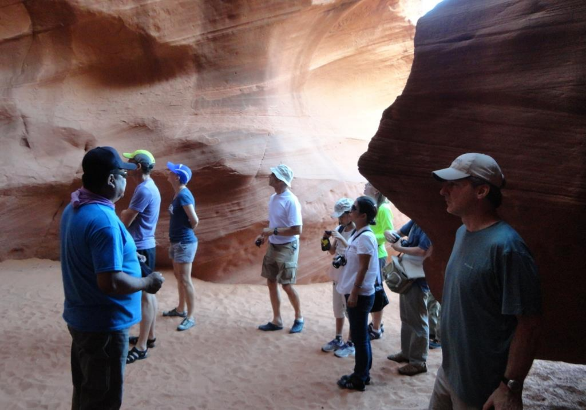
Day 0 (Page) – Inside the slot canyon