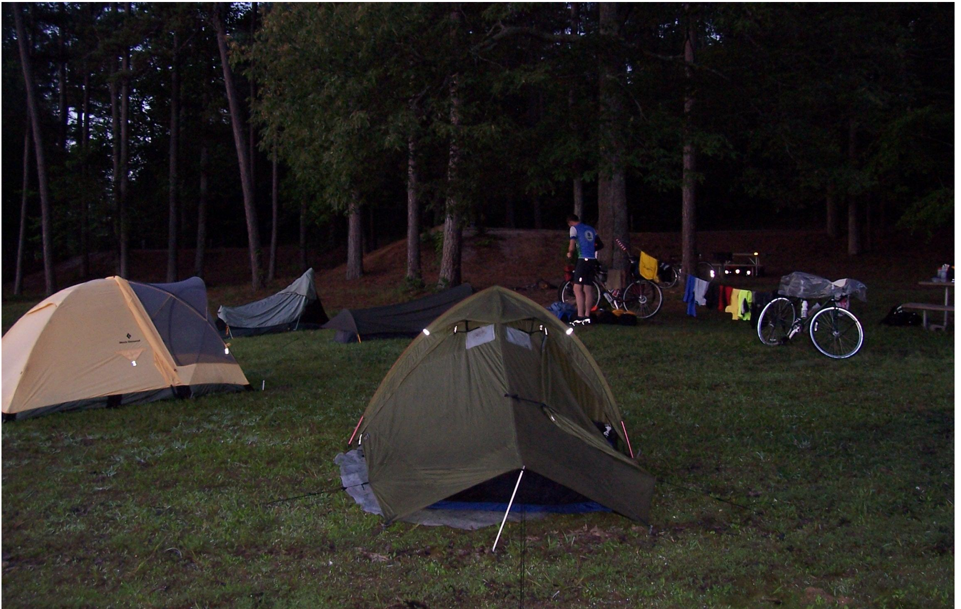
Camping in Tishomingo State Park in northern Mississippi. Each cyclist carried about 40 lb of gear, including camping equipment, food, clothes, tools, etc.