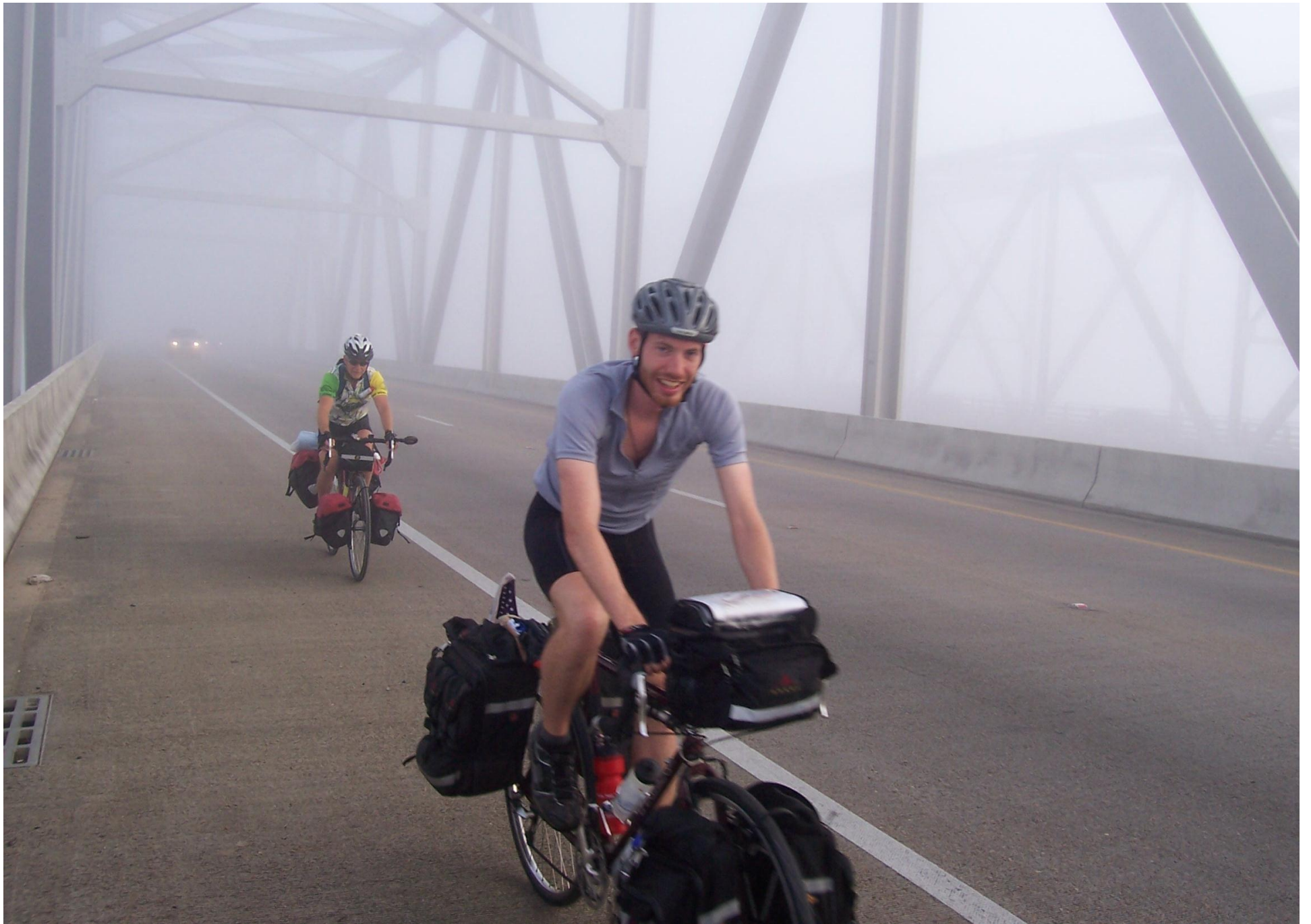
Crossing the Mississippi from Vidalia, LA to Natchez, MS